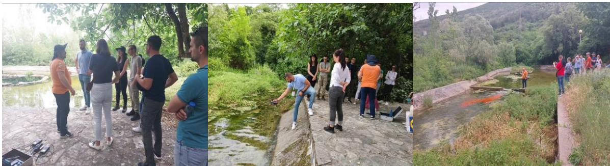
Field work on the Lušac Spring