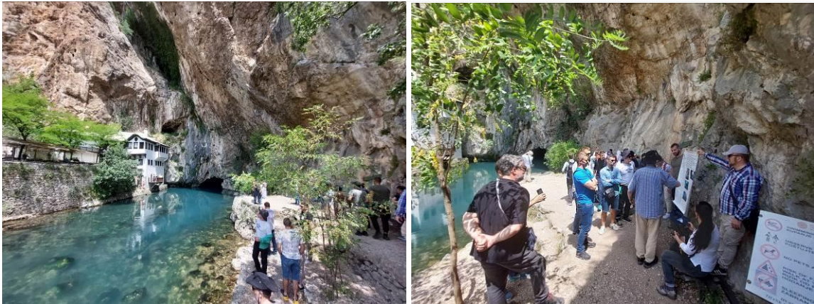
Vrelo Bune Spring