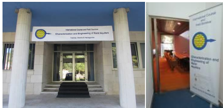
Entrance to the HET and the conference hall

The registration of participants took place on 26 nd May, at the hall of the HET in Trebinje. All participants received course materials (bag, notebook, pencil, hat with the course logo).