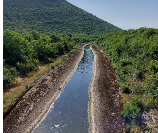
Popovo polje and Trebišnjica River