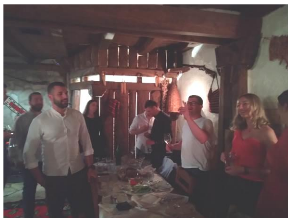
Closing ceremony and Farewell party