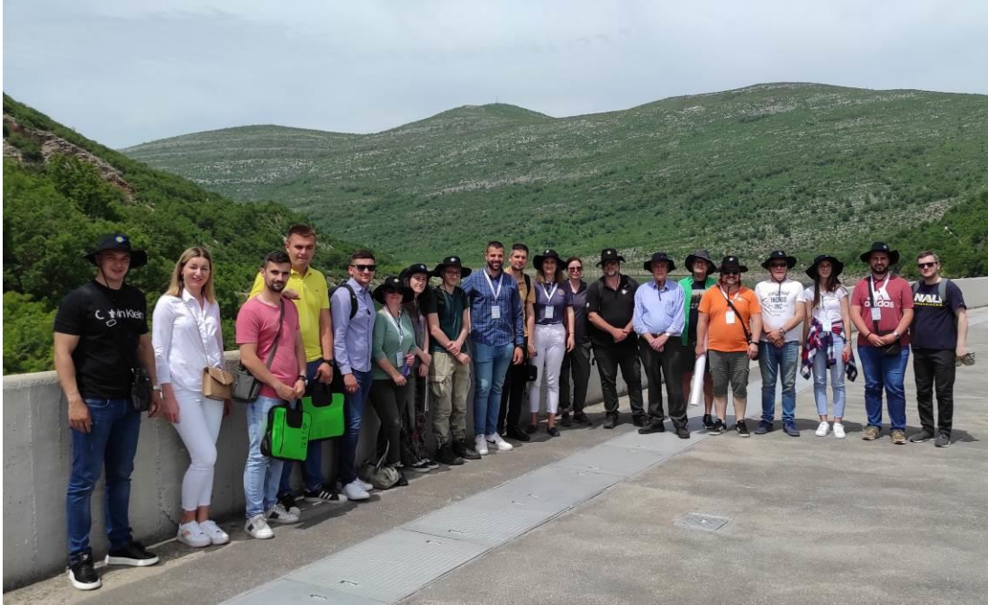
CEKA Team of the year 2022 !