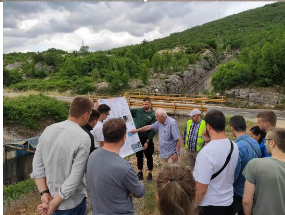
Stops at Dabarsko and Fatničko polje; tunnel connecting Fatnica polje and the Bilećko Lake

After whole day excursion, good atmosphere from bus has transferred to a local ethnic restaurant “Studenac” on farewell party, where also closing ceremony was held. Attendants who completed the course received a Certificate of Attendance, and an additional Certificate which included final grade and credits (6 ESTC) issued by the University of Belgrade – FMG and all lecturers received Certificate of Appreciation for participation in the course. After this ceremony, participants and lecturers were enjoyed local food and wines. They also enjoyed music and dance, which continued till late hours.