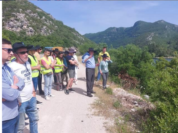
Half-day field trip to Grančarevo Dam and the Oko Spring